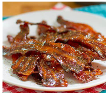
Hot Honey Snacking Bacon