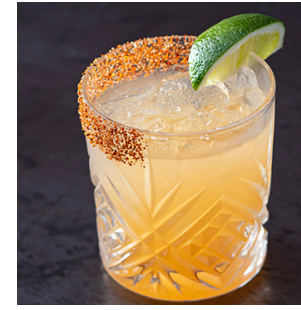
Yard House Picante Margarita Calirosa Rosa Blanco, orange liqueur, citrus agave, cayenne syrup , tajin rim