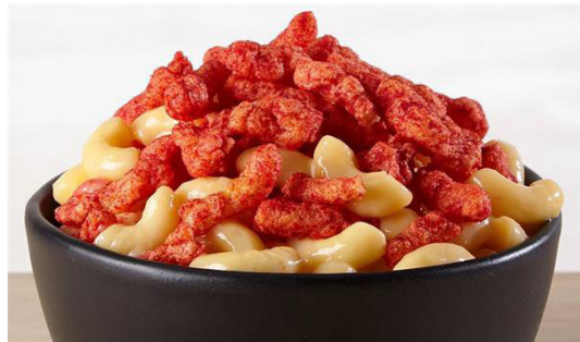
Mac and Flamin' Hot Cheetos

Across generations, nearly three-quarters of consumers (74%) refuse to sacrifice taste when selecting their snacks. Baby boomers are the most unwilling to compromise on taste (84%), followed by Gen Xers (75%).