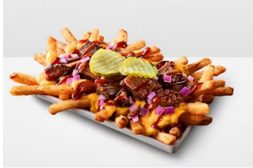
Brisket Loaded Fries