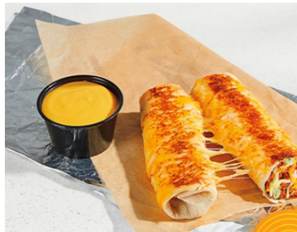
Cheesy Dipping Burritos