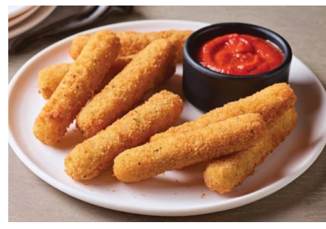
50 cent Mozzarella Sticks

Across generations, nearly three-quarters of consumers (74%) refuse to sacrifice taste when selecting their snacks. Baby boomers are the most unwilling to compromise on taste (84%), followed by Gen Xers (75%).