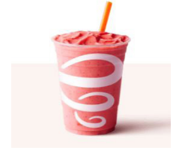
Jamba Watermelon Tajin Smoothie Watermelon flavored grape juice blend, raspberry sherbet, strawberries, pineapples, tajin mild hot sauce