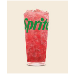
Burger King Fiery Strawberry and Sprite Sprite taken up a notch with a fiery strawberry puree