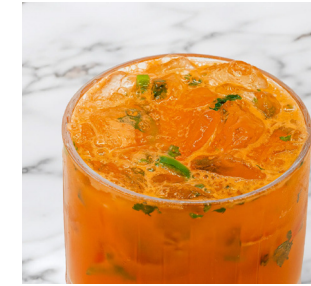
True Food Kitchen Clean Margarita Clean & Co. Tequila, carrot, orange, jalapeño , mint