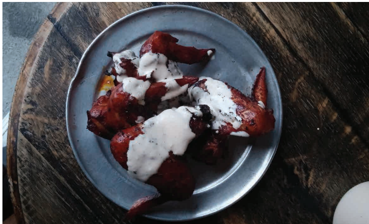
Edward Lee's Gochujang chicken wings with white BBQ sauce