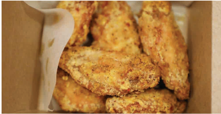
Tenkatori Sawtelle, Los Angeles - "Tebanaka" Japanese style fried chicken wings. Gluten-free. (sweet and spicy, spicy mayo, sweet and sour, yuzu aioli)