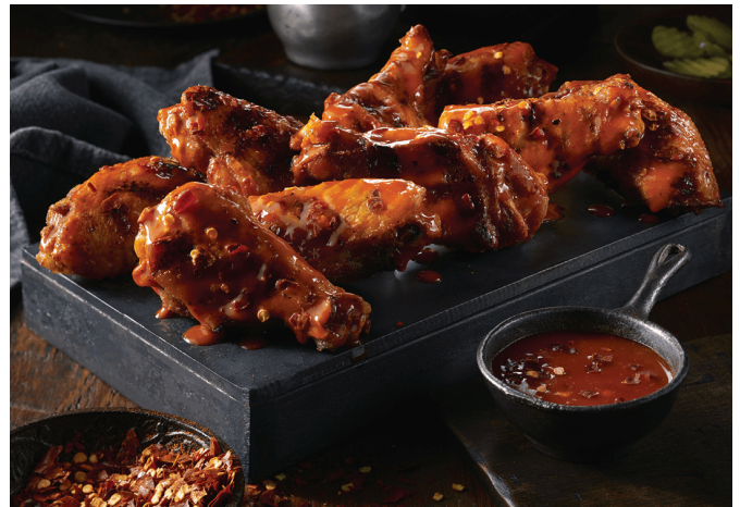
Dickey's Barbecue Pit's -Dickey's Atomic Barbecue Sauce, which pulls heat and flavor from habaneros, chipotle powder and crushed red pepper flakes.

30% of consumers say they would order boneless or bone-in Buffalo wings over other protein-based appetizers**